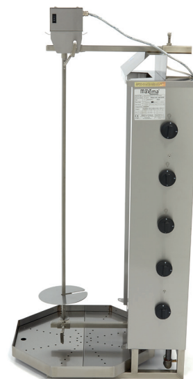
With adjustable skewer for perfect preparation.