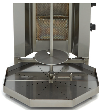
Stainless steel doner grill equipped with drip tray