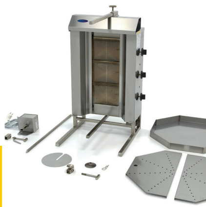
Easy to dismantle and clean