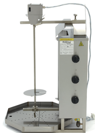
With adjustable skewer for perfect preparation.