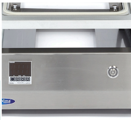
High-quality OMRON digital control panel