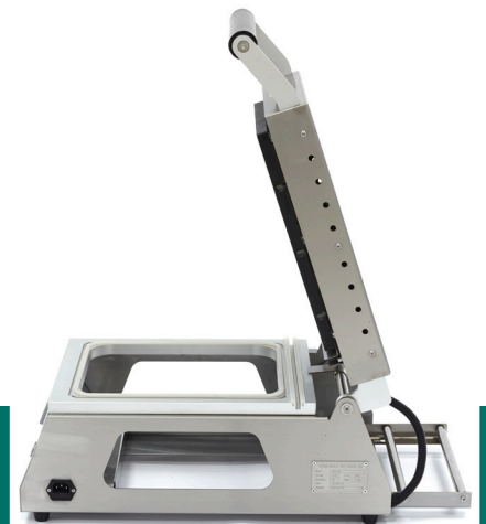
Wide range of moulds in different shapes available