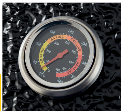
Thermometer with a temperature scale for Celsius and Fahrenheit