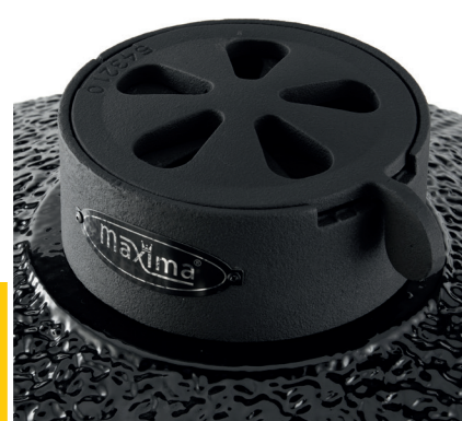
With sturdy cast iron chimney