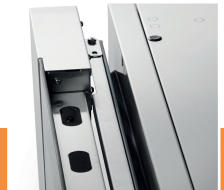
Easily adjustable door