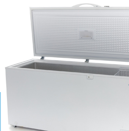
Chromed corners and handle