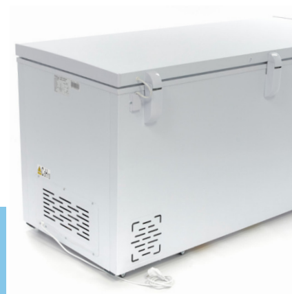
Metal housing with white coating